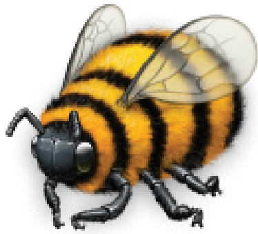
ON THE JOB